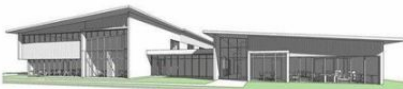
② ENTRY PERSPECTIVE - COMPLETE.