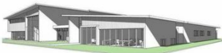
① NORTH WEST PERSPECTIVE.

He said without the State Government's support, they would've had to establish their facility in the US.